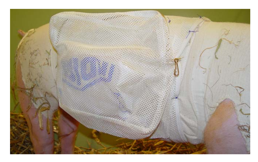
Figure 2. The KARUNO pig jacket that enables 4 liter urine collection without the use of metabolic cages.

below the ribcage into the retroperitoneal pouch. It is important not to lift the ureter ventrally to prevent occlusion of the arterial and venous branches to the grafts dorsal pole. (45,46)