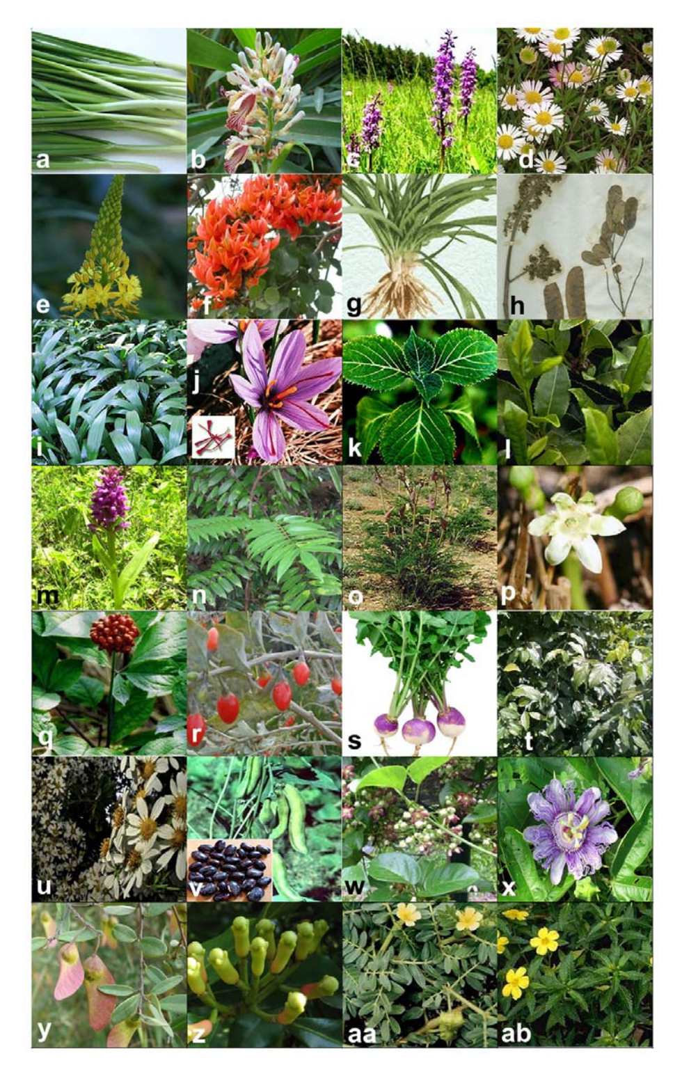
Figure 2. Representative pictures of plants/plant-parts having aphrodisiac properties; a) Allium tuberosum , b) Alpinia calcarata , c) Astercantha longifolia , d) Anacyclus pyrethrum , e) Bulbus natalensis , f) Butea frondosa , g) Chlorophytum borivilianum , h) Caesalpinia benthamian , i) Curculigo orchioides , j) Crocus sativus , k) Corynanthe yohimbe , l) Camellia sinensis , m) Dactylorhiza hatagirea , n) Eurycoma longifolia , o) Ferula hermonis , p) Fadogia agrestis , q) Ginseng r) Lycium barbarum s) Lepidium meyenii , t) Microdesmis keayana , u) Montanoa tomentosa v) Mucuna pruriens w) Mondia whitei , x) Passiflora incarnate , y) Securidaca longepedunculata , z) Syzygium aromaticum , aa) Tribulus terrestris , ab) Turnera diffusa