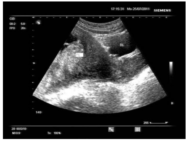
Figure 1. — Ultrasonography depicting placenta previa. BL: bladder; CX: cervix; Pt: placenta.

Following spontaneous vaginal delivery, the placenta failed to expel within 30 minutes. Manual removal of placenta was performed. During the procedure, most of the placenta was removed and some parts were adherent to the uterine wall which lead to vaginal bleeding (around 600 ml). A balloon tamponade was inflated in the lower uterine segment to control the bleeding. Blood coagulation profile returned to normal 12 hours after the delivery.