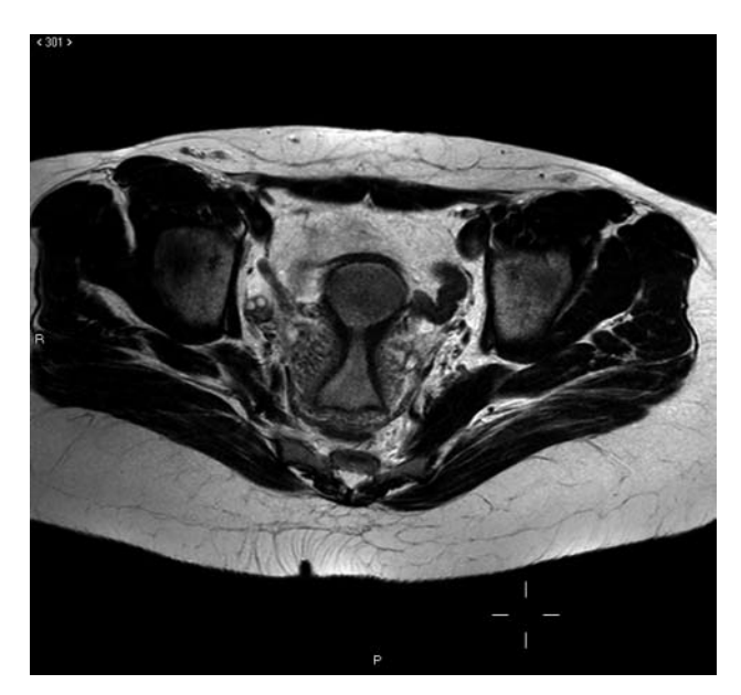
Figure 2. — Oblique-axial T2-weighted image showing a hyperintense niche that extends forward in the opposite direction to the uterine cavity (being the uterus retroflexed).

Sagittal images (Figures 1 and 3) clearly show a retroflexed uterus. A pouch within the anterior wall of the uterine isthmus at the site of a previous cesarean delivery scar, 35 mm deep, is clearly observed on sagittal and transverse views of T2- weighted images (Figure 1 and 2) where the uterine wall is represented by a very thin layer of residual tissue, consisting only of a very subtle layer of myometrium and a thin layer of endometrium lining the inner wall of the pouch, and continuing with the endometrium bordering the uterine cavity. On sagittal T2-weighted images, it is also evident the scar of the CS. By using T1-weighted images with saturation of fatty tissue, hypersignals were detected in the uterine cavity and in the niche suggesting the retention of menstrual blood in the hystmocele (Figure 3).