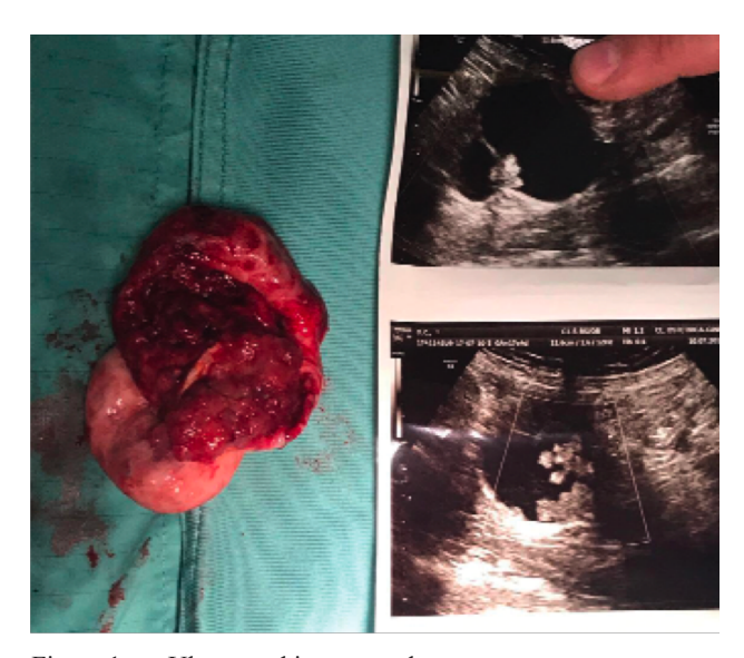
Figure 1. — Ultrasound images and cyst.

The pregnancy progressed normally until the 40th week of gestation, when spontaneous rupture of membranes and uterine contractions occurred. A healthy infant weighing 3.9 kg was delivered vaginally. Histological examination of the placenta was performed after delivery and no sign of pathology was detected.