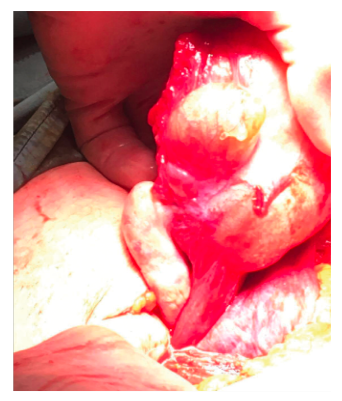
Figure 2. — Right paraovarian cystic mass.

Ideally, it should be performed electively in the second trimester (at approximately 15 weeks of gestation) to minimize the risks of spontaneous abortion, preterm labor, and intrauterine fetal death. Paraovarian cysts are embryological remnants of the paramesonephric or mesonephric ducts. They typically are found in the mesosalpinx. Also, they are