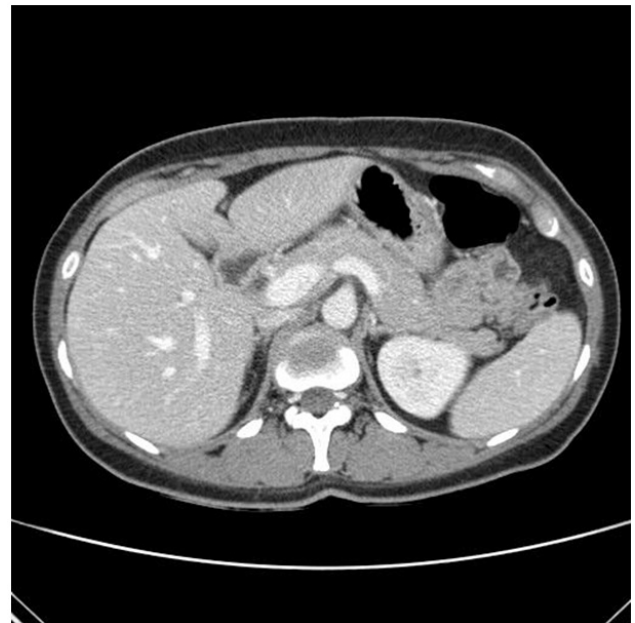
Figure 2. — Improvement in protrusion of liver, stomach, and large bowel observed on computed tomography scan.

The patient visited the outpatient department for follow-up a month later and had the appearance of a normal postpartum woman. Transvaginal ultrasonography showed her uterus to measure 82 × 68 × 83 mm with a small myoma and no fluid or hemorrhage in the posterior cul-de-sac. After three months, the patient underwent abdominal and pelvic CT scan, which revealed an improvement in protrusion of intra-abdominal solid organs at the anterior abdominal noted in the previous CT scan (Figure 2). Since her visit to the hospital to review the CT scan results, the patient decided to follow up.