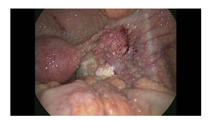
Figure 2. — Laparoscopic image, which revealed a thickened peritoneum and whitish miliary nodules scattered throughout the abdominal cavity.

Finally, the pathological examination showed an epitheloid granuloma with epitheloid cells and multinucleated giant cells (Figure 3). We confirmed the diagnosis of tuberculous peritonitis, which was established postoperatively. At 2 weeks after the operation, the patient received anti-tuberculosis treatment, including rifampicin (RIF) 450 mg/day, pyrazinamide (PZA) 1,000 mg/day, isoniazid (INH) 200 mg/day, and ethambutol (EMB) 750 mg/day. To date, 2 months after the operation, the patient is alive with no evidence of symptoms. Serum CA125 levels also decreased significantly to 58 U/mL within 1 month after beginning treatment.