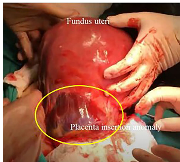
Fig. 2. Appearance after removal of the gravid uterus out of the abdomen at the high transverse incision.

the transversalis fascia by the use of gentle finger dissection. Beginning laterally, the transversalis fascia and peritoneum were divided transversely by using curved Mayo scissors. After reaching the abdomen, the gravid uterus could be pulled out of the abdomen in all cases including the ones in which the placenta reached the umbilicus. The infant was delivered by performing a vertical hysterotomy in the uterine fundus in cases undergoing hysterectomy (Figs. 2,3). A midline transverse hysterotomy was performed in patients undergoing organ-preserving surgery (segmental resection).