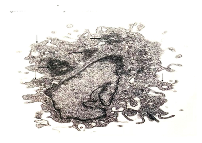
Fig. 2. Electron micrograph of circulating activated endothelial cell showing circulating activated-derived endothelial microparticles. A detached activated endothelial cell exhibited many long cytoplasmic processes, the flask-shaped invaginations on the surface of plasmalemmal membrane (vertical arrows), numerous vacuoles and vesicles in the cytoplasm, and enlarged Weibel-Palade bodies (horizontal arrows) that have a dense matrix housing tubular elements contained the glycoprotein von Willebrand factor. A cluster of discharging caveolae from the rest of the plasma membranes was found in the extracelluar space from activated endothelial cell that is consistent with EMPs. The characteristic of caveolae can be used to distinguish activated endothelial - derived microparticles from platelet- and leukocyte-derived microparticles. Original magnification, ×6300. Adopted from Zhang J, Hanig JP, De Felice AF. Biomarkers of endothelial cell activation: candidate markers for drug-induced vasculitis in patients or drug-induced vascular injury in animals. Vascular Pharmacology. 2012; 56: 14-25.

ferences of circulating endothelial microparticles between endothelial activation and dysfunction. Recently Rogula et al. [29] suggest that circulating endothelial microparticles can be used to monitor inflammation and thrombosis in the course of atherosclerosis, because endothelial extracellular vesicles in the circulation express various CDs (e.g., CD62E, CXD31, CD51, CD105, phosphatidylserine, and tissue factor) from activate or dysfunctional endothelium, and these CDs play roles in proinflammatory, proapoptotic, and procoagulant activities [29].