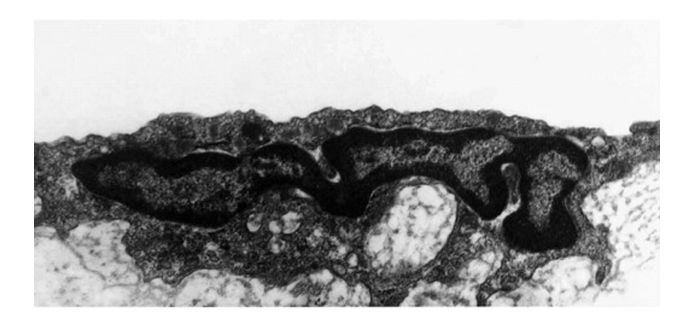
Fig. 4. Electron micrograph of apoptotic endothelial cell showing nuclear imagination and condensation, with numerous vesicles on the cell surface. Original magnification, ×4000. Adopted from Zhang J, Herman EH, Knapton A, Chadwick DP, Whitehurst VE, Koerner JE, et al. SK&F 95654-induced acute cardiovascular toxicity in Sprague-Dawley rats-Histopathologic, electron microscopic, immunohistochemical studies. Toxicogic Pathology. 2002; 30: 28–40.

control patients with stable cardiac disease and 15 healthy subjects. Substantially increased levels of endothelial annexin V<sup>+</sup> microparticles were found 24 hours after cardiopulmonary resuscitation in resuscitated patients. Furthermore, study of Fink et al. [32] also provides evidence for enhanced apoptosis of endothelial cells under the influence of microparticles of resuscitated patients ex vivo . Microparticles of cardiopulmonary resuscitation patients may contribute to endothelial apoptosis by conjugates pathway in which endothelial-derived microparticles inter-