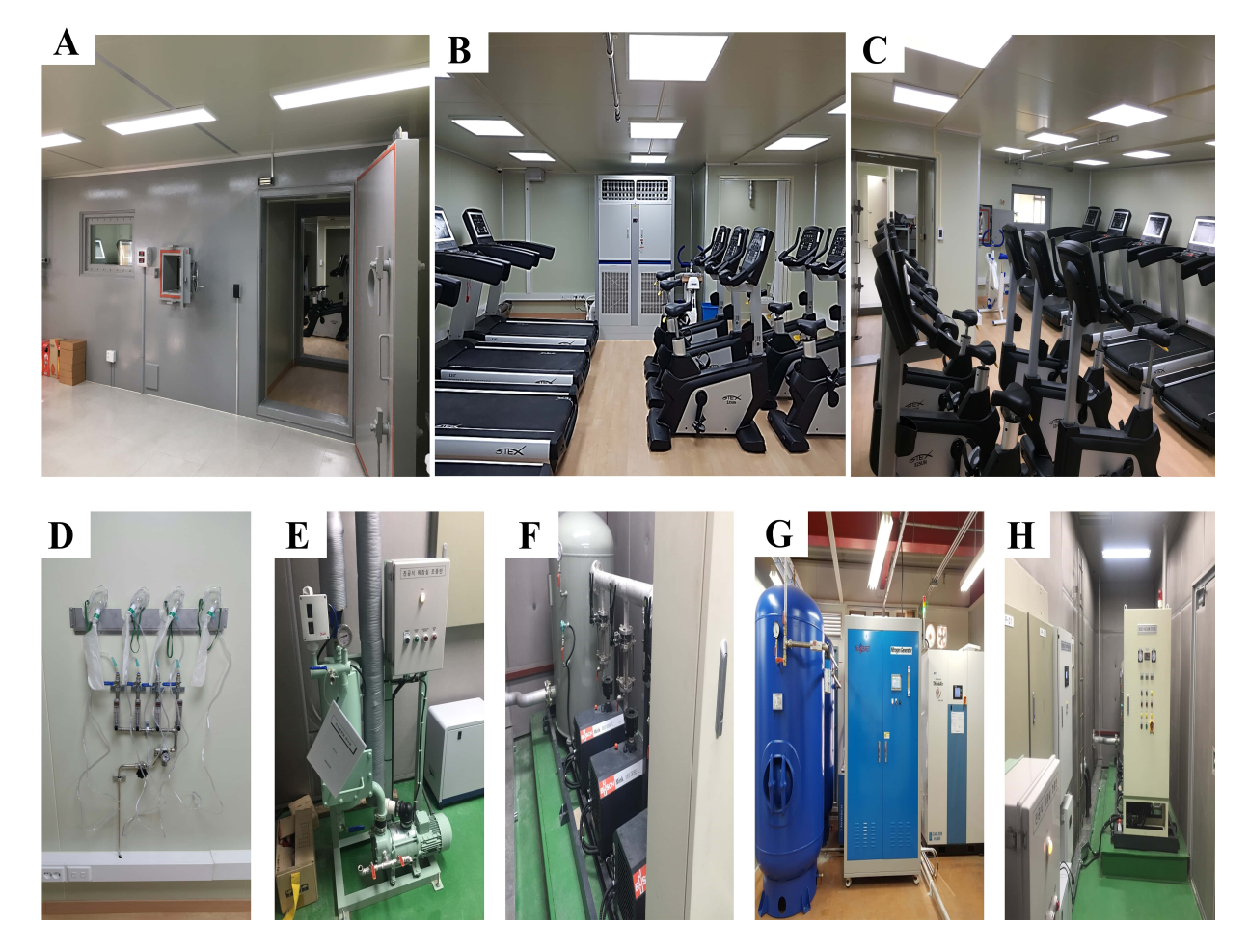
Fig. 1. Environmental control chamber equipment for various hypoxic therapies including exposure and exercise intervention under hypoxia. (A) External view of the environmental control chamber. (B) Front view of the inside of the environmental control chamber. (C) Posterior view of the inside of the environmental control chamber. (D) Emergency oxygen supply equipment. (E) Vacuum toilet system. (F) Vacuum pump device for hypobaric hypoxia. (G) Nitrogen generator for normobaric hypoxia. (H) Vacuum pump panel.

is positioned in the field of alternative medicine [21,23–25]. Hypoxic therapy such as hypoxic exposure or hypoxic exercise intervention can be used to increase cardiovascular benefits and to treat or prevent CVDs (Fig. 2). Therefore, this review focuses on the effectiveness and potential applications of hypoxia therapy.