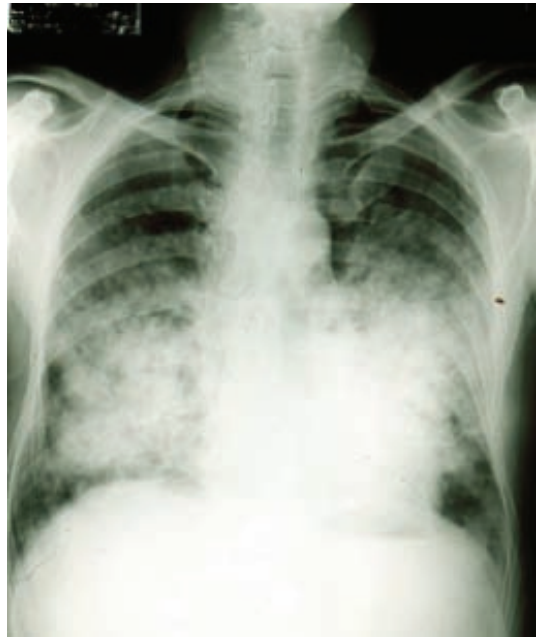
Figure 2. After the direct current cardioversion procedure, the patient developed acute pulmonary edema.

heard on cardiac auscultation. Chest x-ray was consistent with new pulmonary edema (Figure 2). Sinus tachycardia was recorded on an ECG (Figure 3).